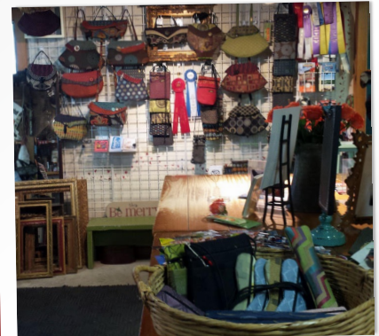
WALL OF PURSES ON DISPLAY