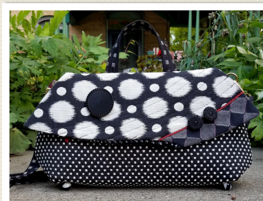
BLACK & WHITE HANDBAG