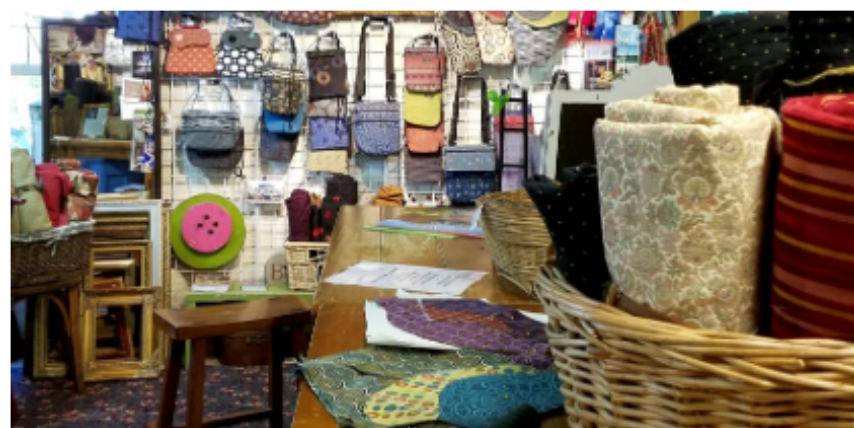
PURSES & FABRICS ON DISPLAY AT HELEN'S DAUGHTERS STUDIO