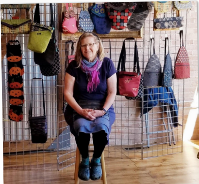
PURSES AND BAGS ON DISPLAY

Studio playlist: I listen to Wisconsin Public Radio. If I'm listening to music it would be to WORT in the morning. Folk music.