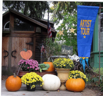
OUTSIDE THE STUDIO AT THE FALL ART TOUR LAST YEAR