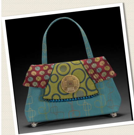
TEAL & GREEN HANDBAG