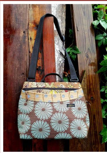
EARTHY COLORED OVER THE SHOULDER BAG