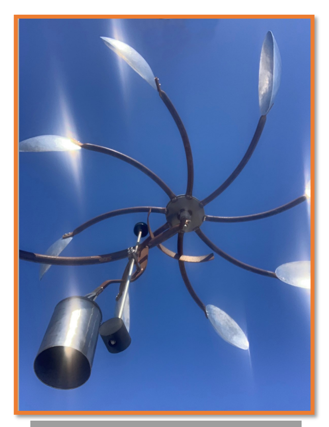
New sculpture in the works

The storm chaser turned out to be a big fan of the original movie and the artwork. He said he must have watched Twister dozens of times since it came out, and he knows the sculptures from the movie by heart.