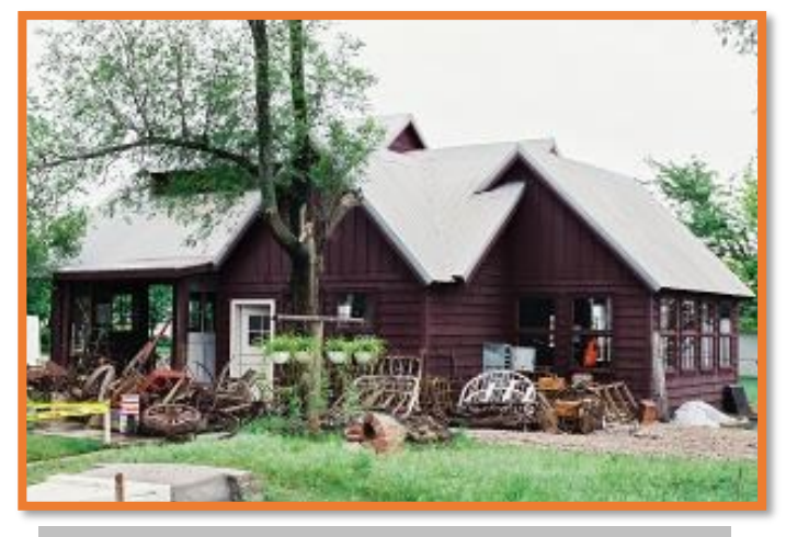
Movie set sculpture studio

The large operating budget enabled the purchasing agent to rent several sculptures, some of which had to be taken on a loan from collectors. That was not enough, however. More sculpture work was needed!