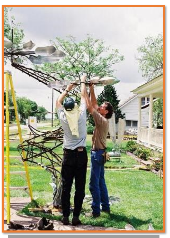
Sculpture installation on the set

Once the movie came out, we were pleasantly surprised by the number of people who commented on the artwork in the movie. They could tell that these were real sculptures, made by a professional artist.