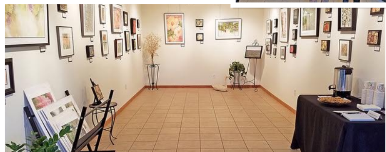
ART ON DISPLAY DURING THE 2019 FALL ART TOUR