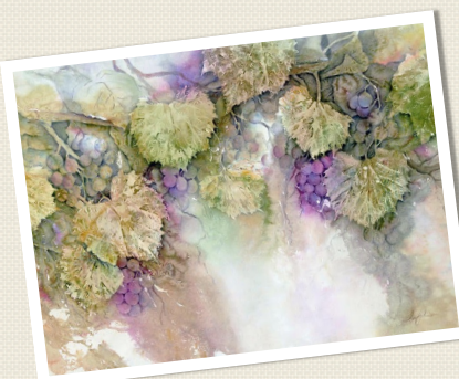
ESSENCE OF THE VINEYARD