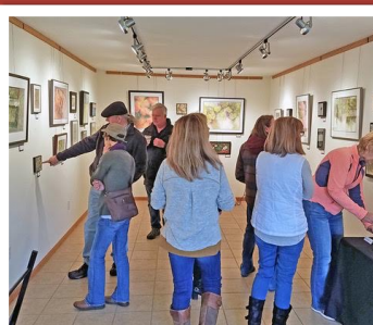
RIGHT: VISITORS IN THE STUDIO

I find sitting by the creek listening to the calming water sounds, a walk in the woods or relaxing by a campfire are some of my favorite ways for me to create balance. Spending time with family and friends I find is very important for recharging myself mentally.