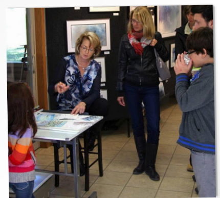
DEMONSTRATING DURING THE 2019 FALL ART TOUR