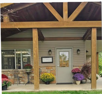
EXTERIOR OF SUE'S STUDIO

Studio playlist: Instrumental music with no lyrics to interrupt the inspirational flow that the music gives me.