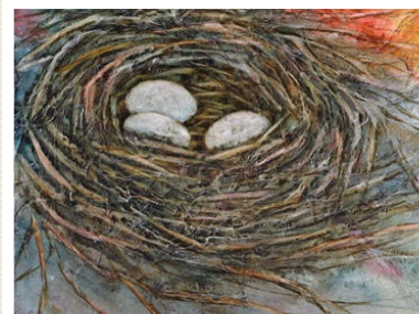
EDGE OF THE WOODS