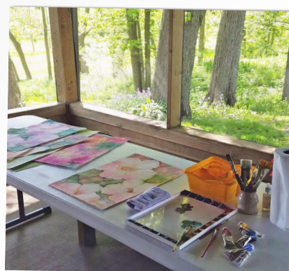
TABLE WITH SOME WORKS IN PROGRESS