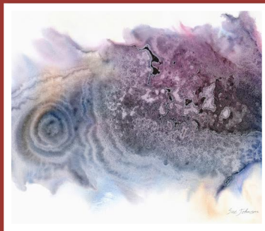
GEMSTONE SERIES: GEODE II