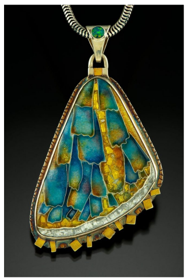
BUTTERFLY WING PENDANT NECKLACE