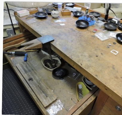
IN THE STUDIO: WORK DESK