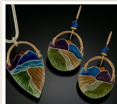
CLOISSONNE EARRINGS & MATCHING NECKLACE