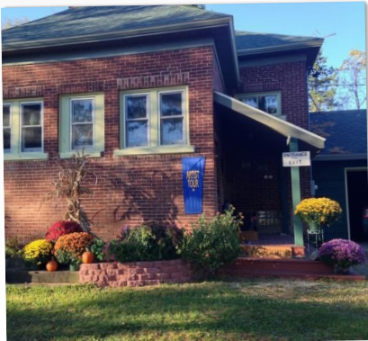
NO RULES STUDIO DURING THE 2019 FALL ART TOUR

Studio playlist (music/podcasts): I listen to audio books or whatever my husband and studio mate is playing. Sometimes NPR if it is of interest.