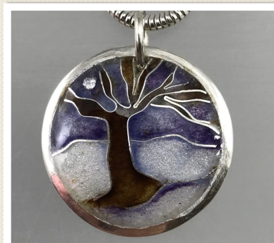
TREE PENDANT NECKLACE