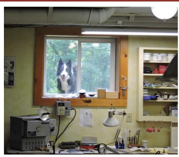
RILEY THE DOG LOOKING IN THE STUDIO WINDOW