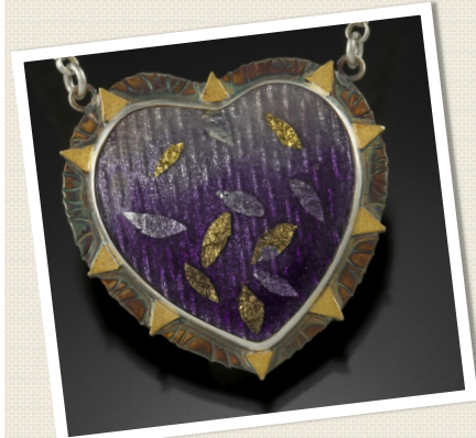
ENAMELED HEART NECKLACE