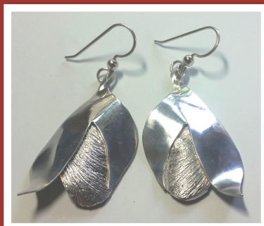
STEP THREE: VOILA! THE FINISHED PRODUCT.