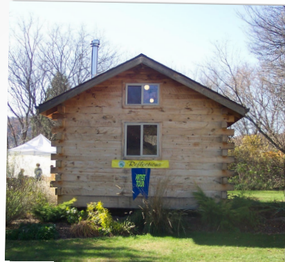
FALL ART TOUR BANNER HANGING OUTSIDE IN 2019