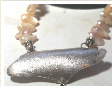
NECKLACE WITH PEARLS