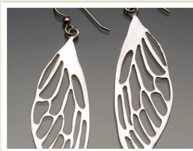
DRAGONFLY WING EARRINGS