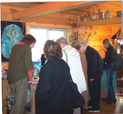
PEOPLE VISITING DURING THE FALL ART TOUR LAST YEAR