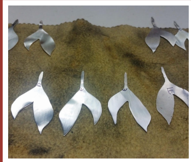
STEP ONE: ROUGHLY CUT SHAPES ARRANGED IN PAIRS.