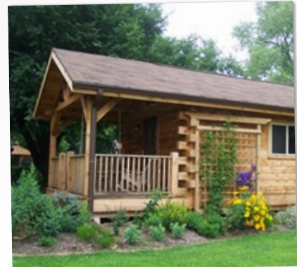
STUDIO HOUSED INSIDE AN AMISH LOG CABIN