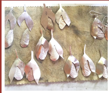
STEP TWO: THE SAME SHAPES PLUS AN ADDITIONAL TEXTURED PIECE ON THE BOTTOMS.