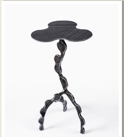
CUSTOM DRINK TABLE