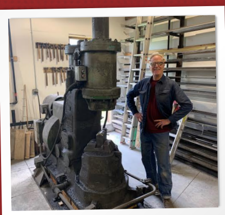
A PRIZED POSSESSION: NAZEL 2B POWER HAMMER

Music: Africa, India, Latin America. Any and all ethnic music.