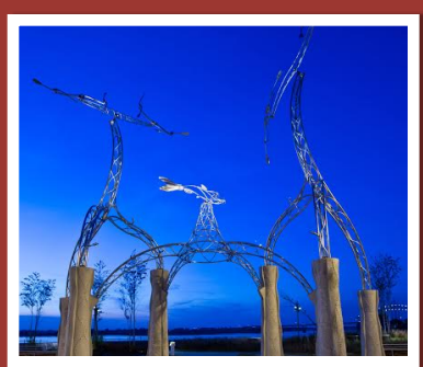
"MEANDER" PUBLIC COMMISSION IN MEMPHIS, TN