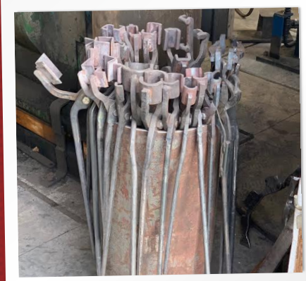
BUCKET OF HANDMADE TONGS USED FOR FORGING