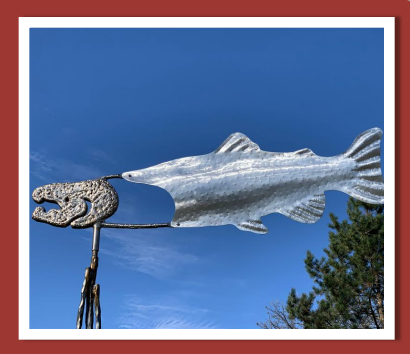
KINETIC FISH WEATHERVANE