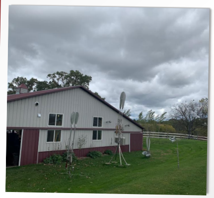
THE STUDIO WITH SEVERAL OUTDOOR SCULPTURES