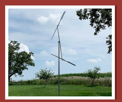
NEW KINETIC SCULPTURE