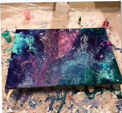
POURING PAINT & WORKING WORKING ON "ENIGMA"

Studio playlist: It all depends on my mood and what I am doing. I have a "Fun Mix" and "Chill Mix" on my phone that I play in the background while I work.