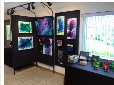
ARTWORK ON DISPLAY