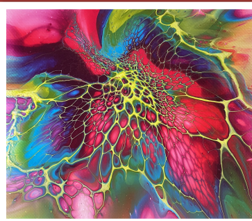
MIXED MEDIA BLOOM