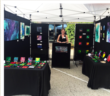
ARTWORK ON DISPLAY