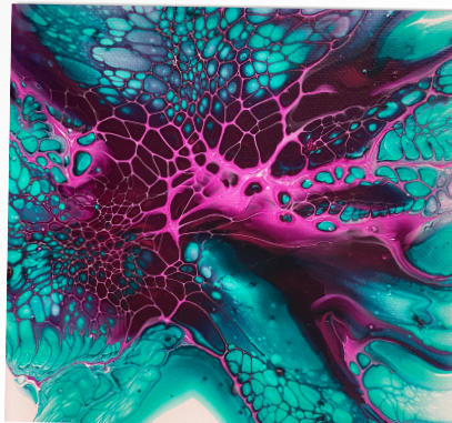
"MIXED MEDIA BLOOM"