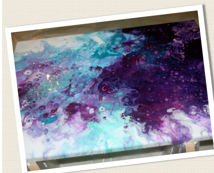
POURING PAINT IN THE BASEMENT