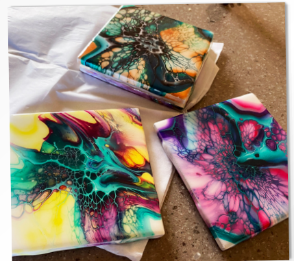
EXAMPLE OF ARTWORK ON TILES