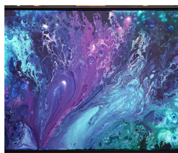
"ENIGMA" FINAL PIECE