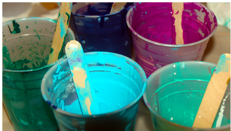
BRIGHT & BEAUTIFUL PAINT!

When I create, I need to be completely clear of any task lists either at home, on the road or at work. My mind needs to focus on my art and not what I need to tackle later in the day. I do tend to do my best work in the late afternoon and at night when a majority of my day is behind me.