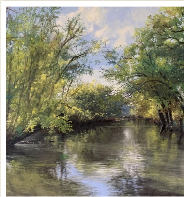
VIEW OF THE BARABOO RIVER