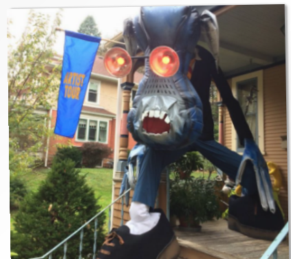
FALL ART TOUR "OFFICIAL GREETER" AT THE FRONT DOOR