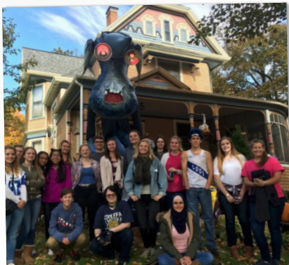
EXTERIOR PHOTO DURING THE 2019 FALL ART TOUR

Equipment used: canvas / hand-built birch panels/ oil paint, (Talents, Rembrandt) Arabian gum turpentine, and walnut oil Large variety of brushes. Favorite tools: Coffee-cup, make-up cleaning wedges (because they are the best tool to wipe off a mistake or pre-oil a surface) – Sennheiser sound canceling Bluetooth headset,