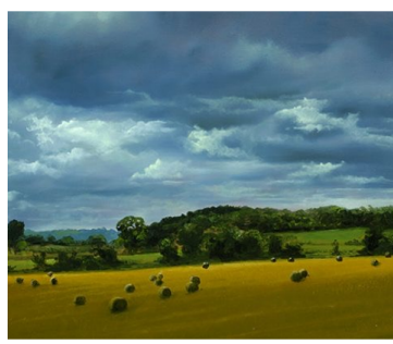
VIEW FROM THE CRANE FOUNDATION