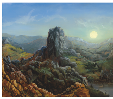
ILLUSTRATION FROM 'LEONARDO DREAMS OF HIS FLYING MACHINE'