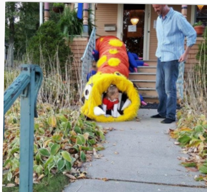
ANNE ENTERTAINS A SMALL CHILD WITH A WORK PUPPET