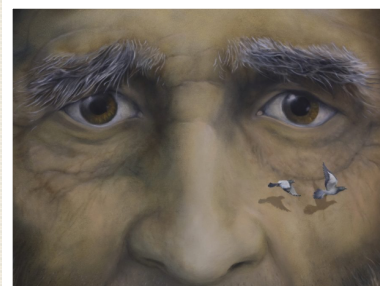
ILLUSTRATION FROM 'LEONARDO DREAMS OF HIS FLYING MACHINE'