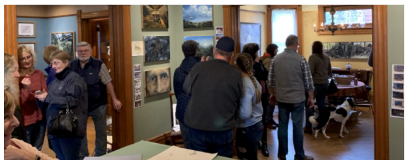
GUESTS VISITING ANNE'S STUDIO DURING THE 2019 FALL ART TOUR