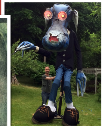
A HANDMADE PUPPET