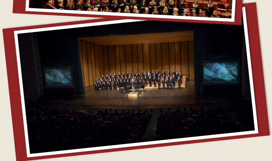
ABOVE: TWO PHOTOS OF A FEW DIFFERENT STAGE PERFORMANCES FEATURING ANNE'S ARTWORK AND ILLUSTRATION