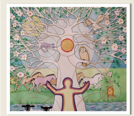
TREE OF LIFE: SPRING