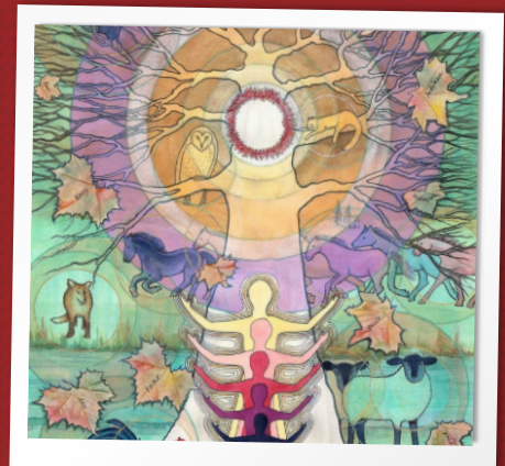
TREE OF LIFE: AUTUMN