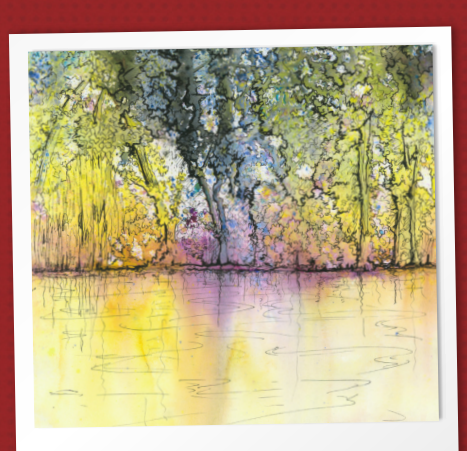
TREES BY WATER

Studio playlist: Silence. Music distracts me, I end up listening to the music instead of painting.