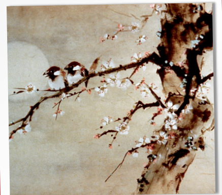
BIRDS IN MIDNIGHT