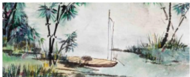
BOAT AND BAMBOO