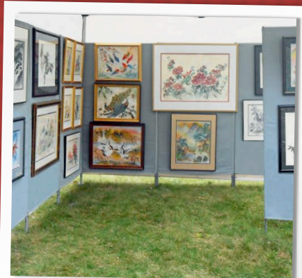
ART FAIR DISPLAY