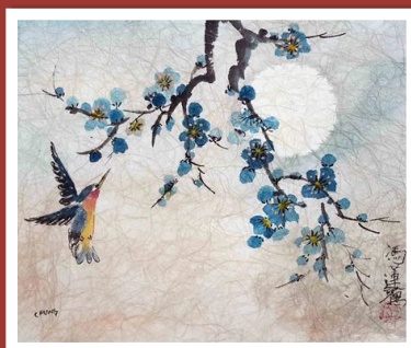
Bird, Moon and Cherry Blossoms