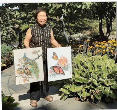
HOLDING NEW WORK

Studio playlist: WPR classical music and NPR news.